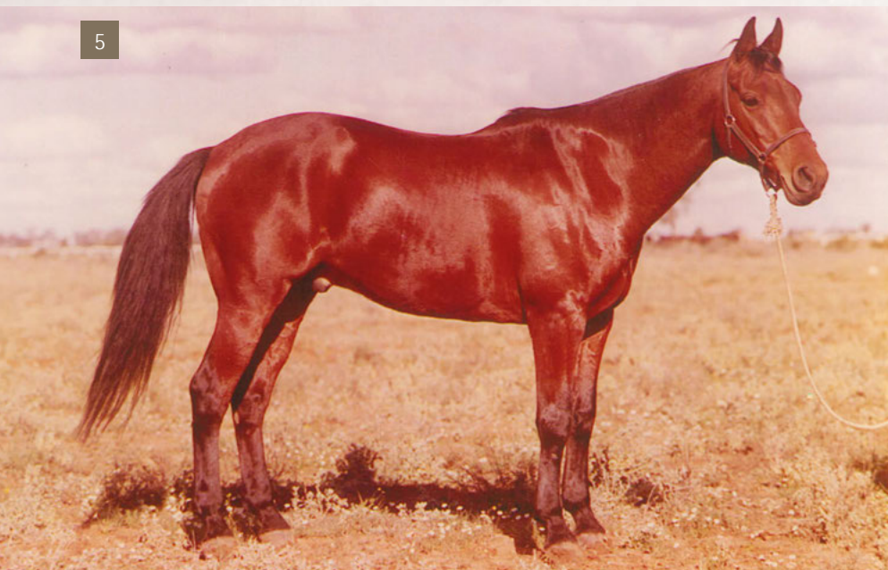
5. STANTON STUD DODGE - FS HSH from the July/August 2004 ASH Journal, page 17